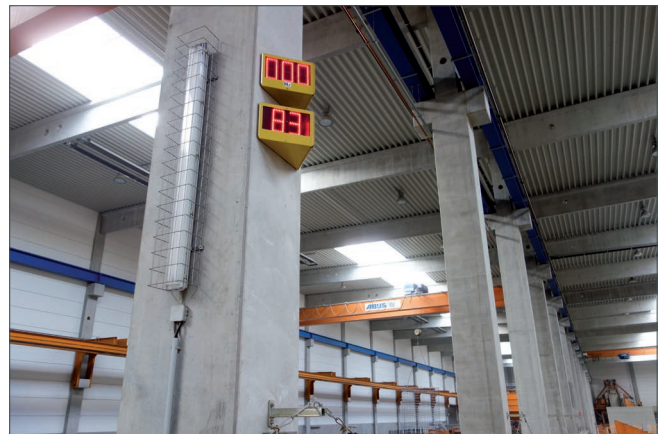
Large panel display for groups and frequency