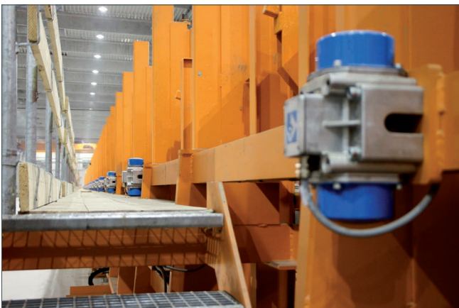
Attached to a formwork