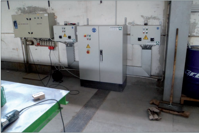
Inverter control and junction boxes