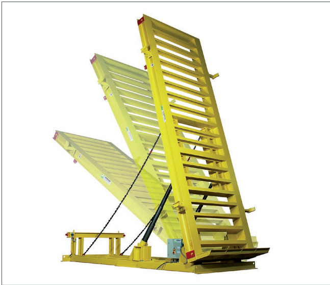
Transportable lifting station for walls