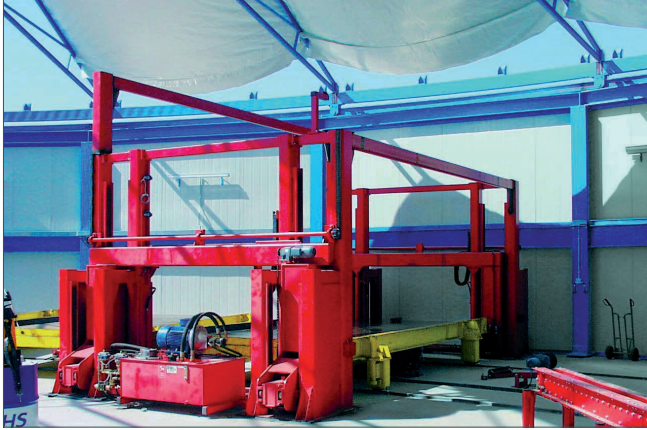
Stacking and unstacking station for circulation pallets