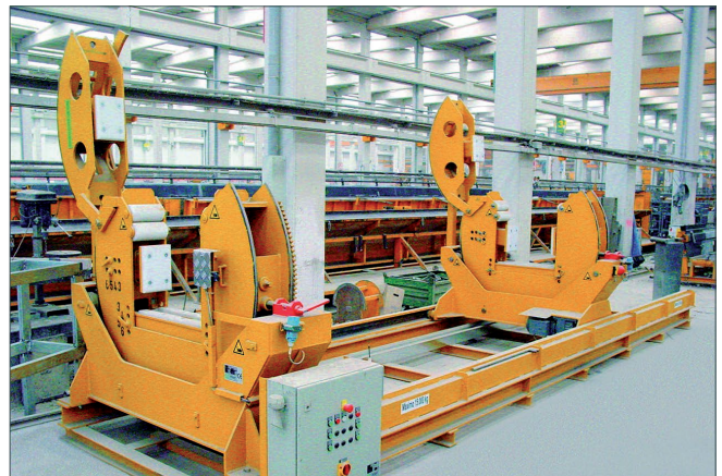
Turning device for columns for the refinishing

Special machines are developed and manufactured according to your individual requirements. For this purpose our team of experts will be at your disposal for most different tasks.