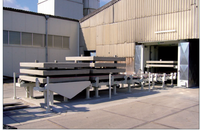
Stacking device for concrete slabs